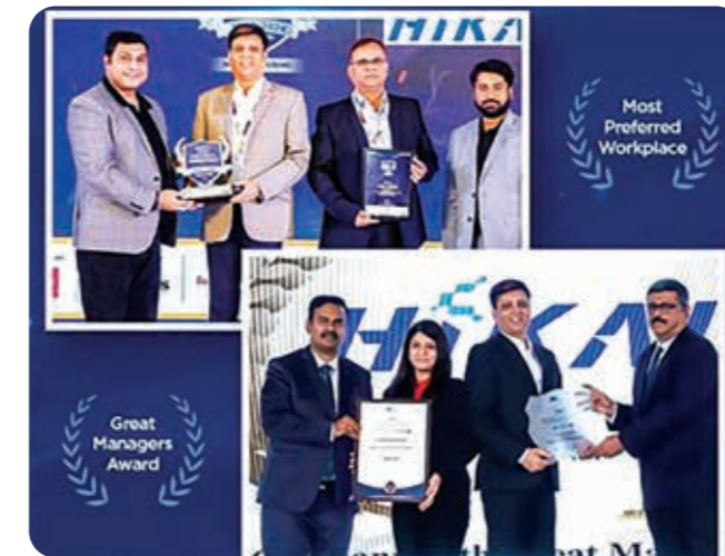
Awarded the 'Most Preferred Workplace' (Manufacturing Edition) 2023-2024 by Marksmen Daily and the esteemed 'Great Managers Award' 2023-2024 by People Business for the consecutive year. We received this award for our commitment to provide a positive and healthy work environment to our employees.