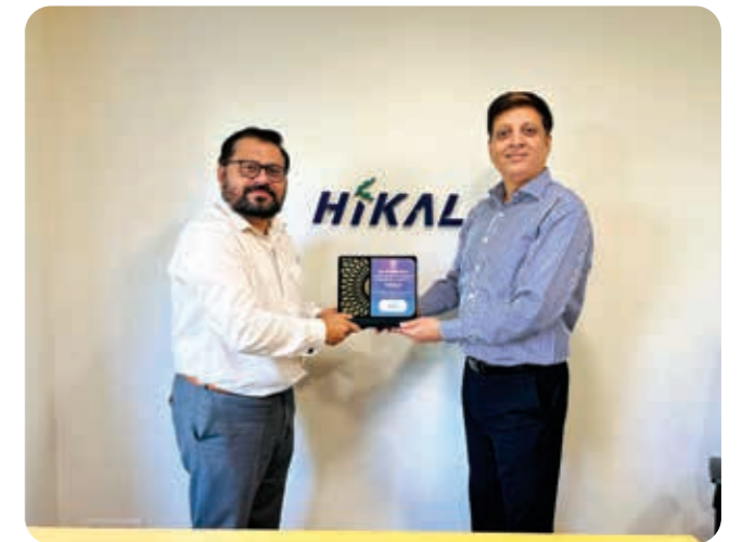
Honoured by the Computer Society of India (CSI) for the exceptional cyber security team in the manufacturing sector during the CSI Cyber Security FIFC Awards 2023.