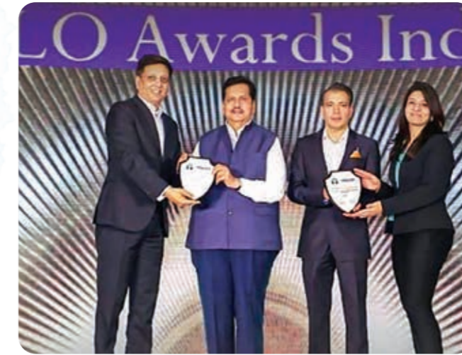
Received two prestigious awards in Learning and Development – 'Best Corporate University in Pharma' and 'Coaching/Mentoring Programme in Pharma'.