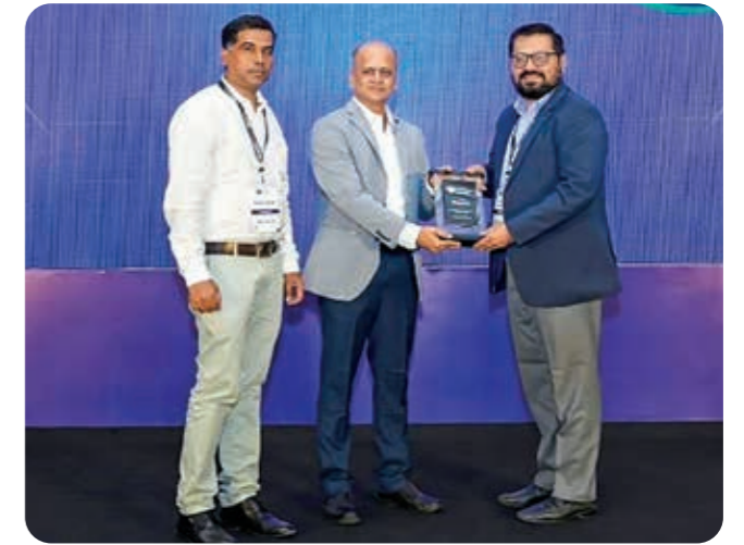
Honoured with Annual Cyber Security Excellence Award for our robust IT Infrastructure and IT Strategy for 2023-24. This recognition underscores our unwavering commitment to excellence in IT and cyber security.